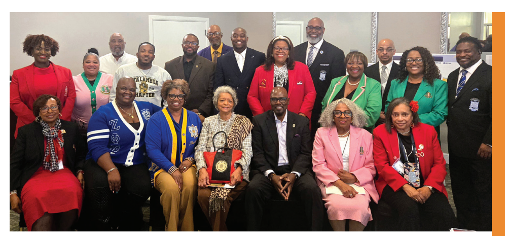
Pictured above are representatives from the Indianapolis Coalition on Educational Equity and guests